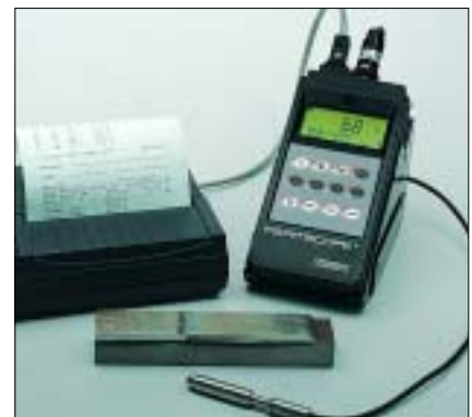
FERITSCOPE® MP30E for standardized non-destructive measurement of the ferrite content in austenitic welded products or in duplex steel.

FISCHER is a reliable and competent partner, offering expert advice, extensive service, and training seminars.