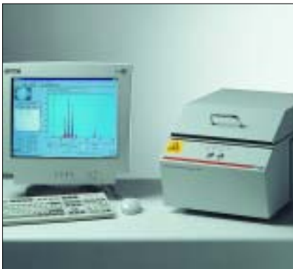
FISCHERSCOPE® X-RAY XAN energy dispersive spectrometer for quantitative material analysis from A(Z=13) to U(Z=92).

cation. A comprehensive range of products is offered using X-ray fluorescence; Beta-backscatter; Magnetic; Magnetic induction; Electric resistance; Eddy current and Coulometric techniques. HELMUT FISCHER has 13 subsidiary companies and 32 marketing agencies strategically located around the globe.