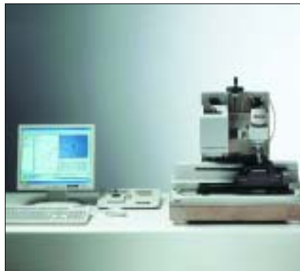
FISCHERSCOPE® HM2000 with WIN-HCU® for the measurement of the microhardness HM according to ISO 14577.

The high quality standard of FISCHER instruments is the result of our efforts to provide the very best instrumentation to our customers.